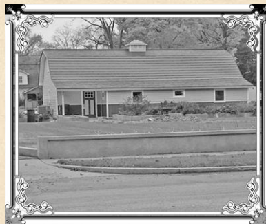
Renovations in process, 2017.